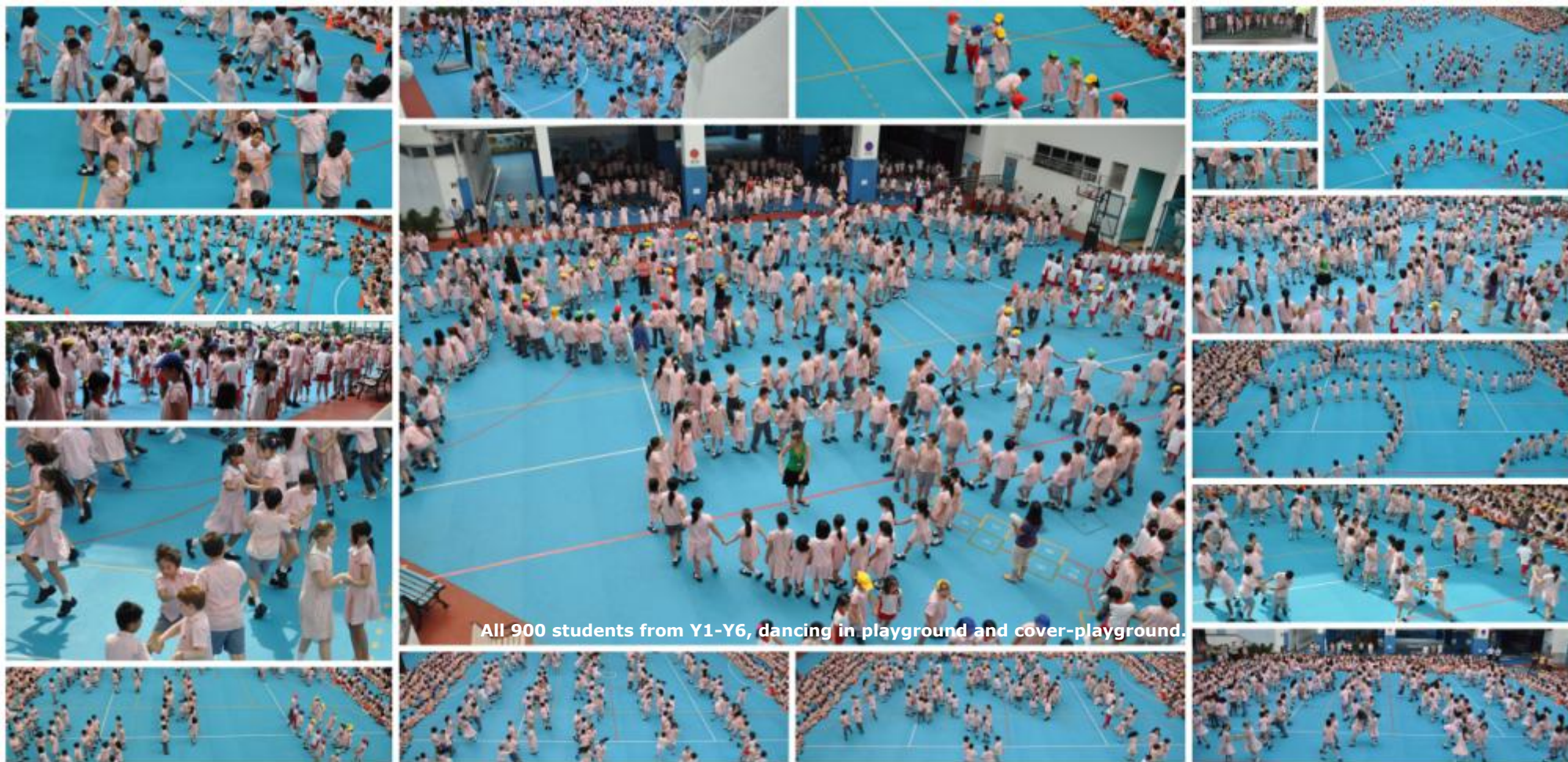
All 900 students from Y1-Y6, dancing in playground and cover-playground.