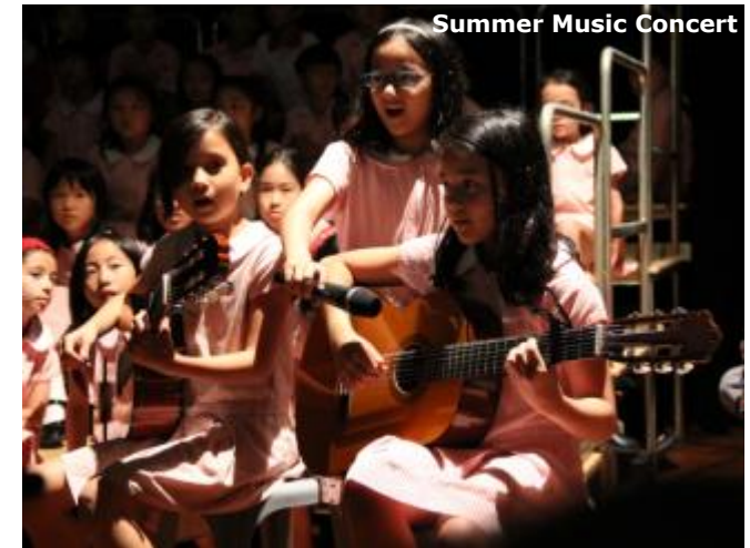
Summer Music Concert