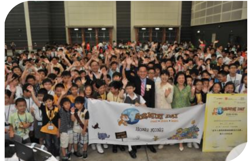
Here is a photo taken at the Scratch Day 2011 by the organizer. My two SJS classmates and I was standing at the front row (Left side of the banner). by Enoch

http://scratch.mit.edu/projects/sdhk2011/1800226