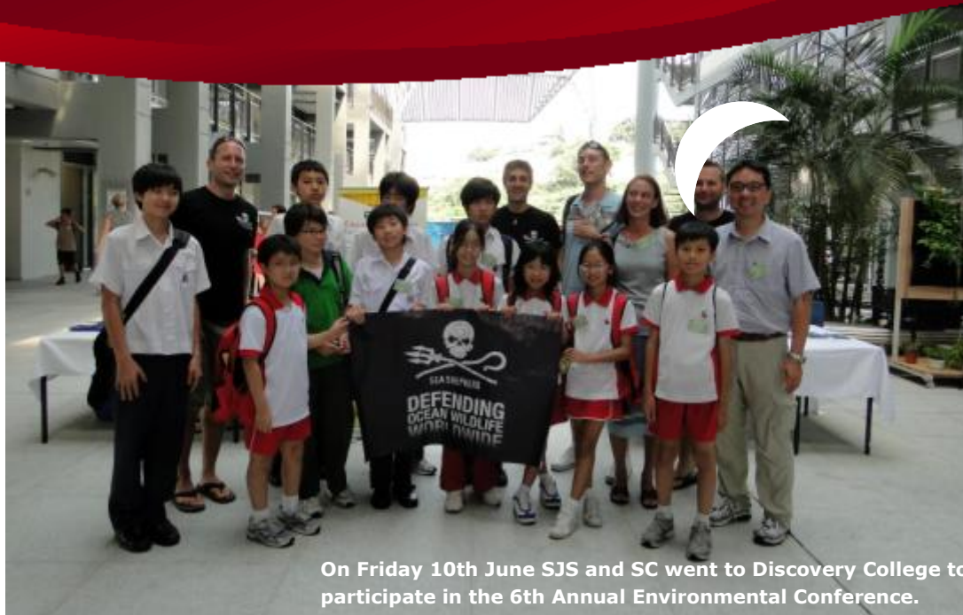
On Friday 10th June SJS and SC went to Discovery College to participate in the 6th Annual Environmental Conference.