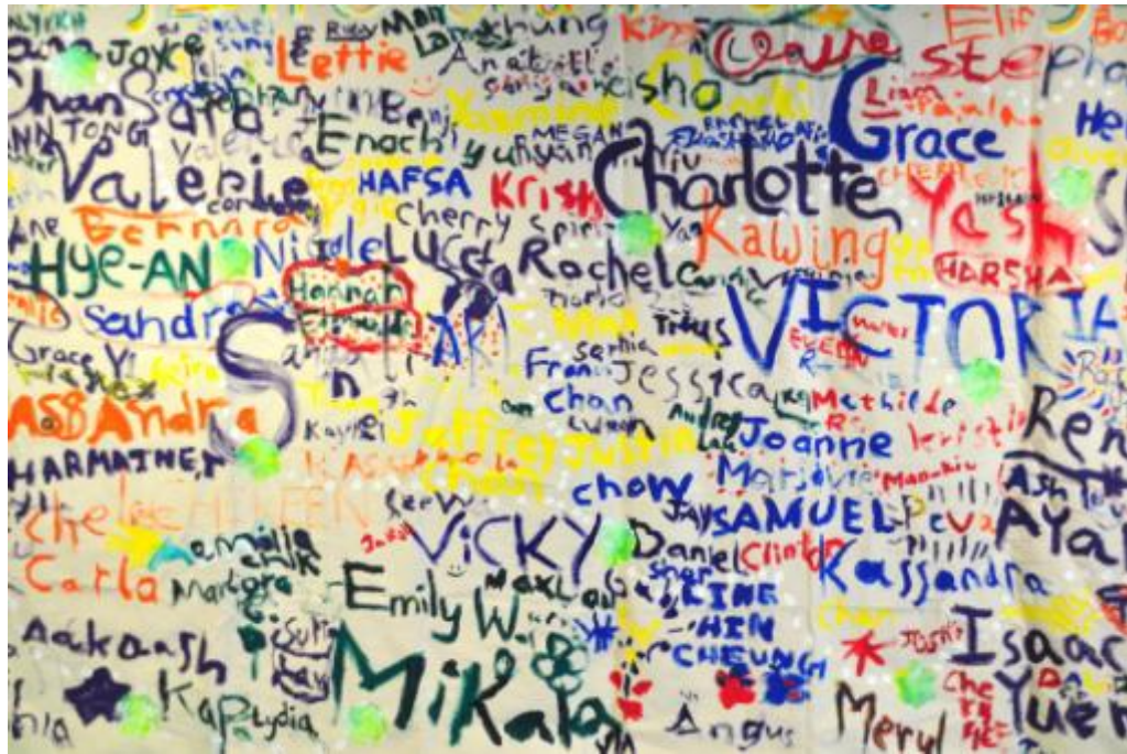
This artwork is now displaying in the school office.

( Please click any picture or link to the designated page )