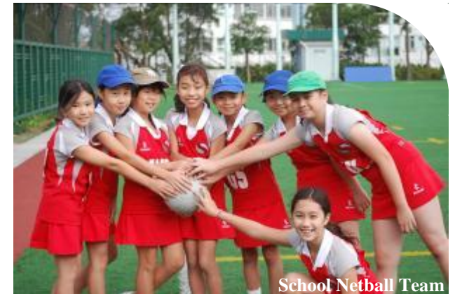
School Netball Team

They include clubs run by teachers as well as a range of activities provided by outside providers. Activities range from the creative to the sporting.