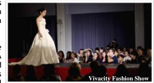
Vivacity Fashion Show

Facilities at SJS are safe, secure and of the highest standard. A broad range of out-of-school and extra-curricular activities is offered. The school is supported by an active Parent Teacher Association.