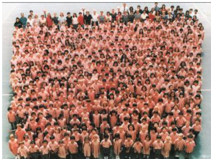
SJS: two decades of dedication

Sha Tin Junior School opened in 1988 to serve the growing needs of families in the New Territories for an English-speaking education. Opening as a 3-form entry primary school, SJS quickly grew to a maximum enrolment of 540 children. In recent years the building of an extra wing and the use of shared facilities with Sha Tin College have enabled us to reach our current size of 900 pupils.