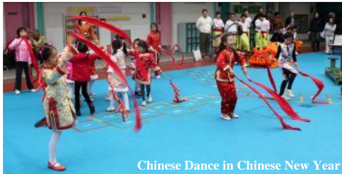
Chinese Dance in Chinese New Year