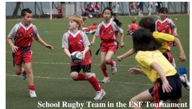
School Rugby Team in the ESF Tournament