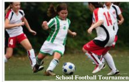
School Football Tournament

The ESF is proud of its high academic standards and the excellent achievements of the students - more than 95% of whom go on to leading universities world wide.