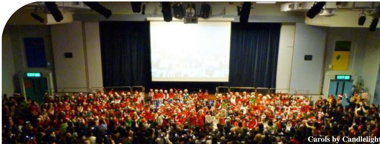
Carols by Candlelight