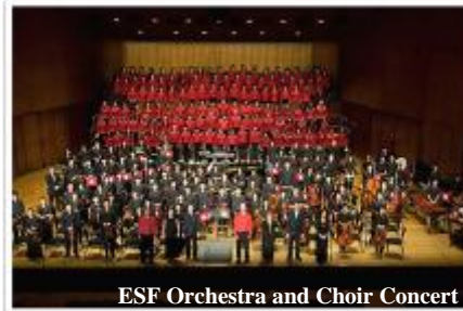
ESF Orchestra and Choir Concert

ESF employs over 800 teachers, all of whom are highly qualified, with experience of UK, Australian and other international school systems. The teaching staff is augmented by over 1000 support and administrative staff. Over 12000 students attend ESF schools, made up of representatives from over 50 different nationalities. More than 70% of students have parents who are permanent residents of Hong Kong.