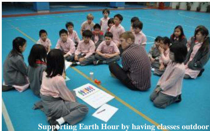
Supporting Earth Hour by having classes outdoor

At School we believe strongly in the value of a comprehensive extra-curricular activity programme to augment the work children carry out as part of the curriculum. The details of our school clubs are outlined in a separate booklet.