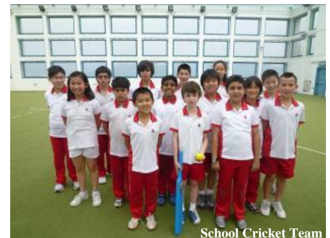
School Cricket Team